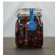
My Mother's Olives 1L $23.50