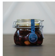
My Mother's Olives 500ml $13.50