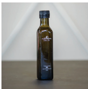
My Mother's Olive Oil Small 250ml $12.75