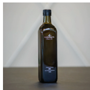
My Mother's Olive Oil Large 750ml $31.50